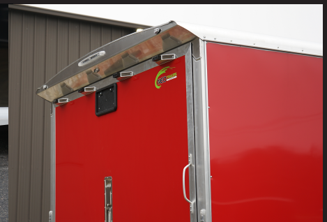
DRT Spoiler, NXP Stainless Steel Latch