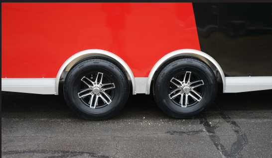
Optional 16" Wheels with 235 80 R16 tires

*Shown with Optional: front ramp door, Prostab jacks, and aluminum wheels.