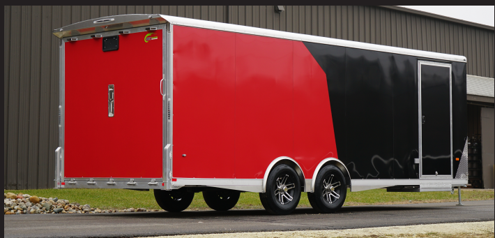
*Standard NXP Stainless Latch and Optional Side Door Step