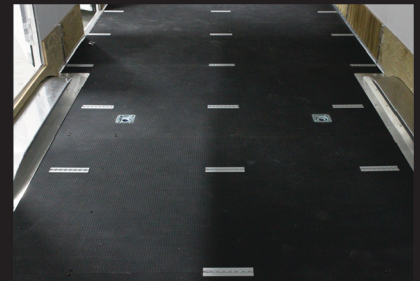
Standard Sport Tie-Down System, Drive-Over Wheel Box and Optional Nudo Floor