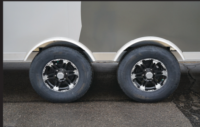
Optional 235 80 R16 and 5200# Axles